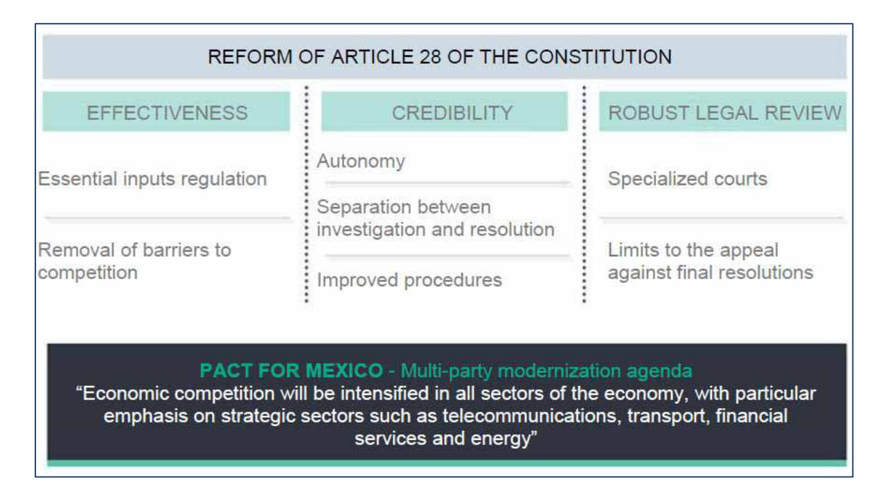
Table 1. Constitutional reform of article 28 in competition matters at a glance